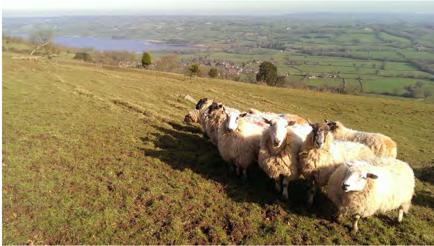
Plate 8. Sheep grazing on the high Mendip plateau, overlooking Blagdon Lake and the Yeo Valley