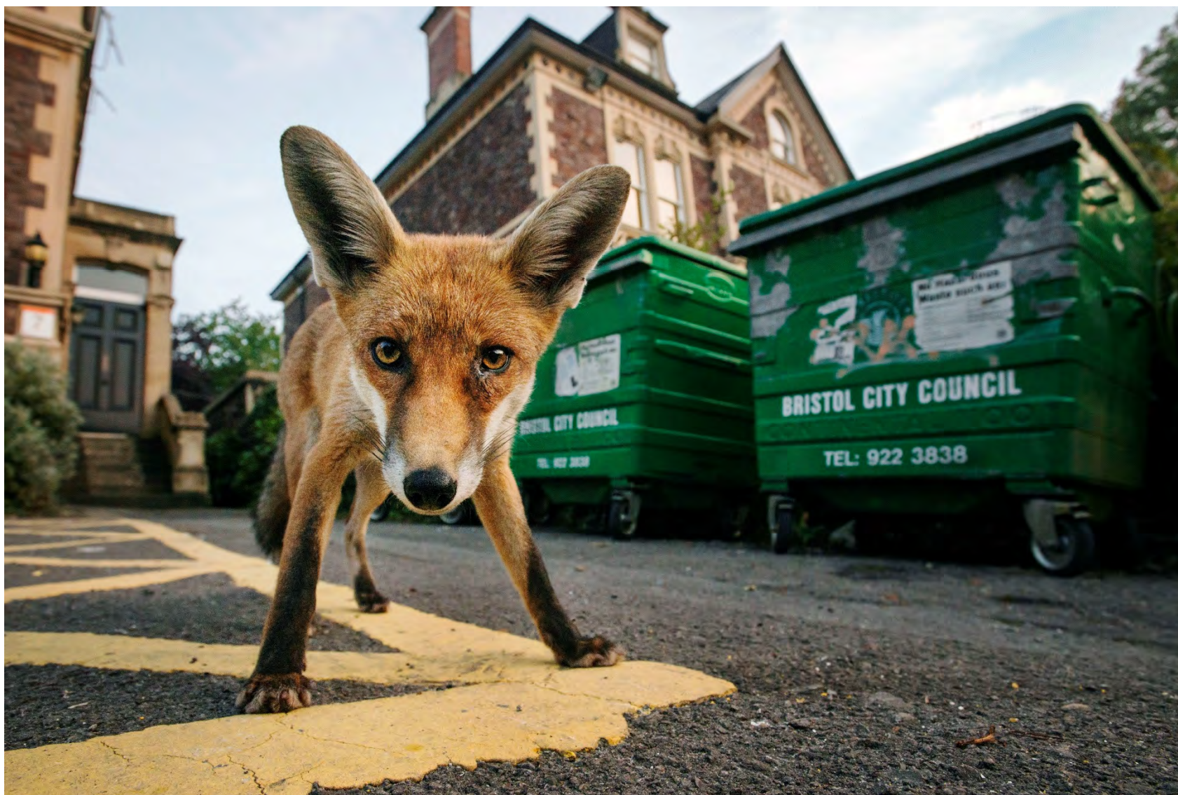
Plate 13. Avon Wildlife Trust's My Wild City project aims to transform Bristol's gardens and open spaces into a city-wide nature reserve; Foxes Vulpes vulpes are found in most parts of Bristol right down to the city centre