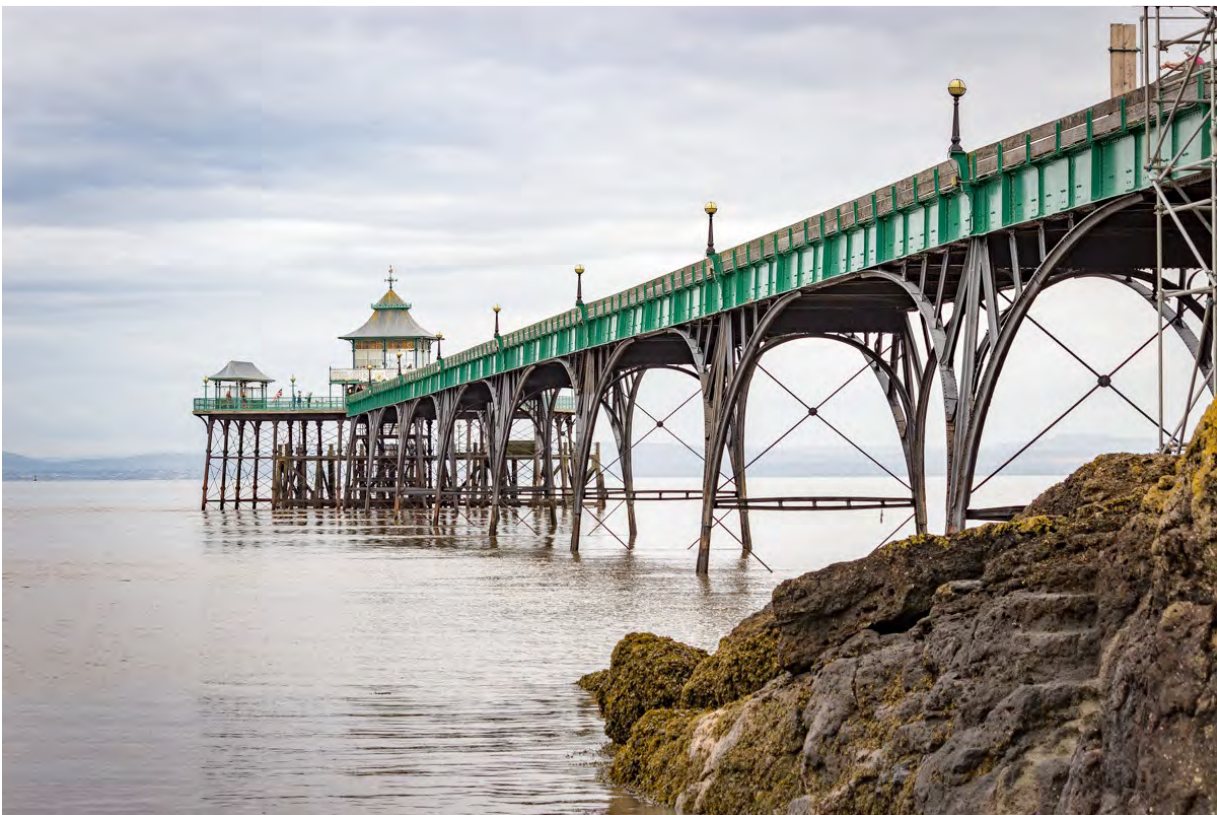
Plate 4. Severn Estuary and Clevedon Pier