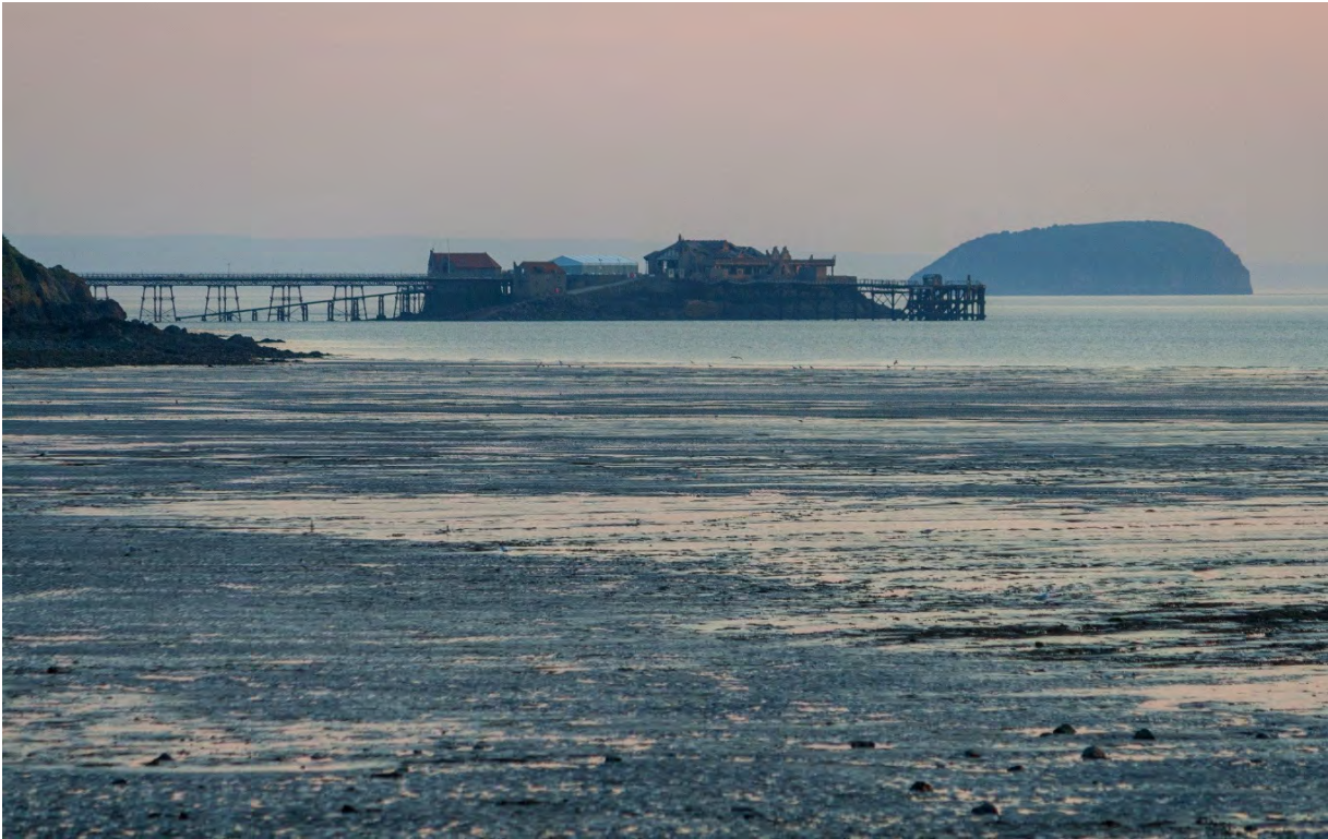
Plate 3. Sand Bay in the foreground; Weston-super-Mare's Birnbeck Pier in the mid-ground and the island of Flat Holm in the background