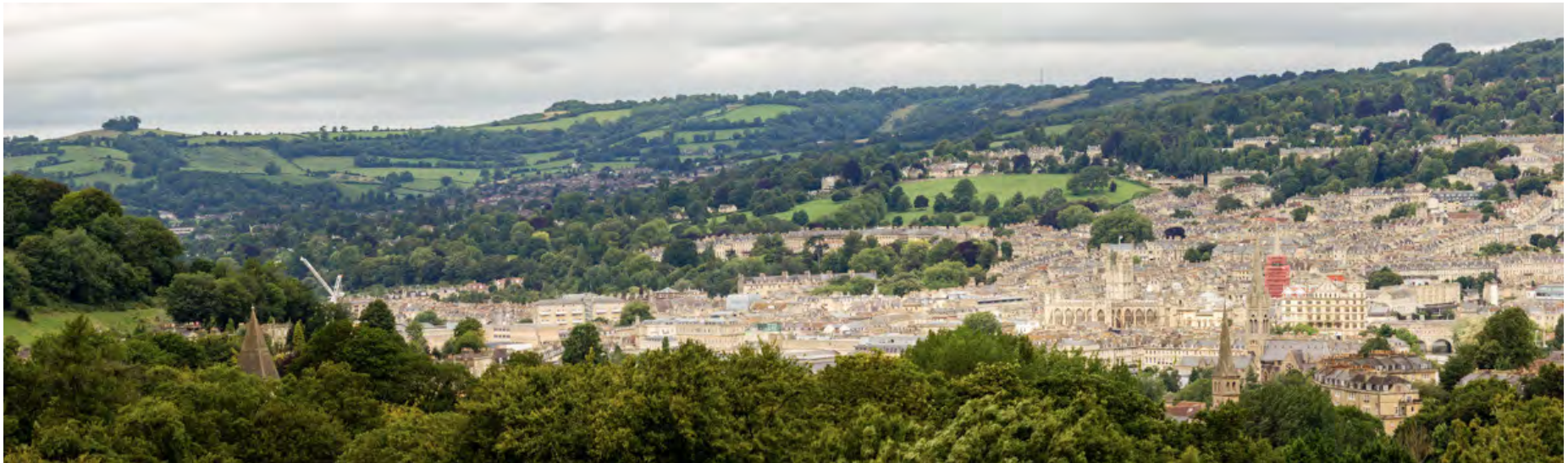
Plate 9. World Heritage City of Bath, set within the southern spur of the Cotswolds Hills