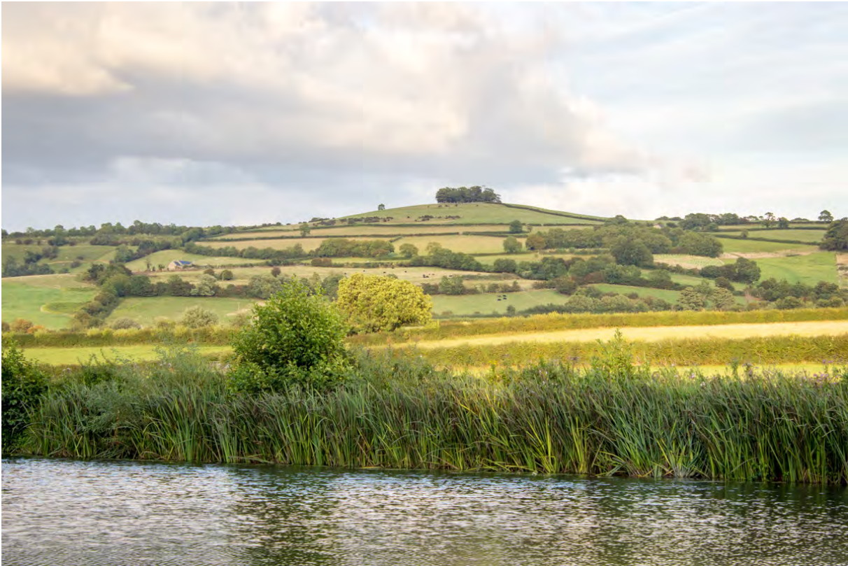
Plate 11. River Avon between Bristol and Bath; Kelston Round Hill in distance