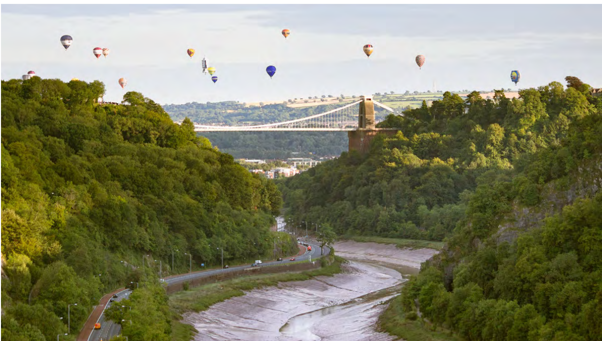
Plate 12. Avon Gorge with Clifton Suspension Bridge and Bristol Balloon Festival in background