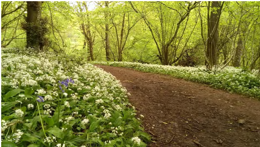
Plate 6. Spectacular display of Wild Garlic in King's Wood (Vale of Winscombe) in the Mendip Hills