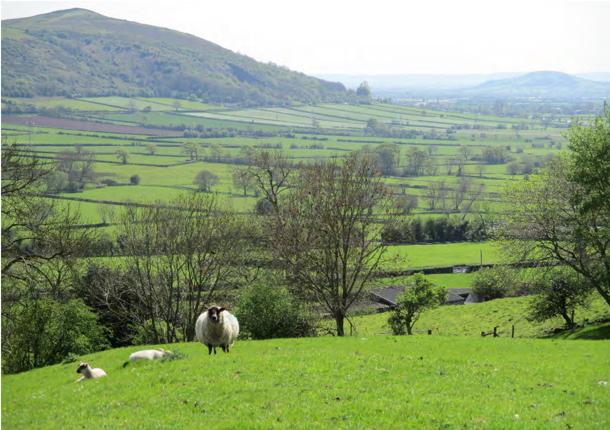
Plate 1. Crook Peak (Mendip Hills) and Loxton Pass (southern gateway to the West of England); Lox Yeo Valley in foreground