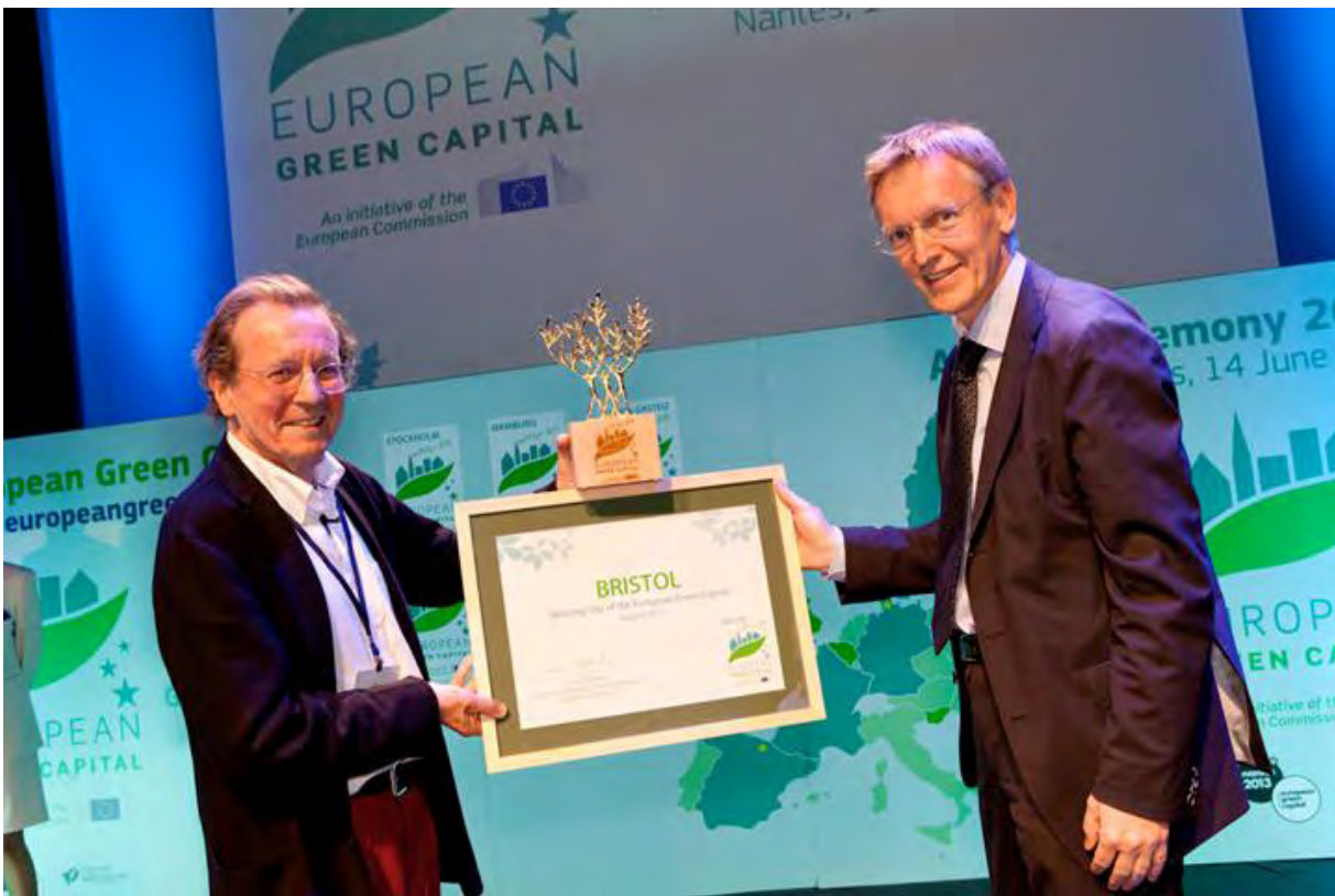
Plate 14. Former Mayor of Bristol, George Ferguson, with European Commissioner for the Environment, Janez Potočnik; Bristol awarded European Green Capital 2015