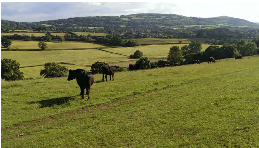
Plate 5. Vale of Winscombe in the Mendip Hills; Wavering Down and Crook Peak in background