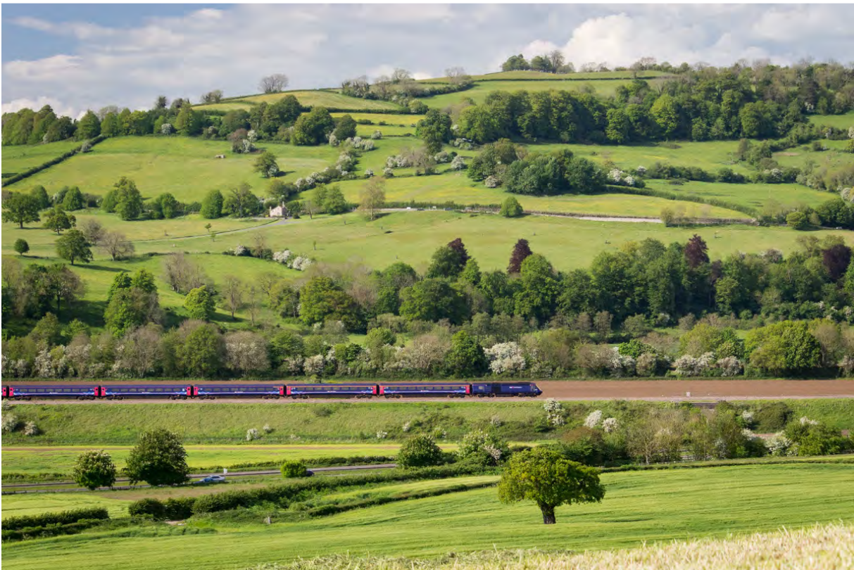
Plate 2. Cotswold Hills Area of Outstanding Natural Beauty near Bath; Kelston Park in background