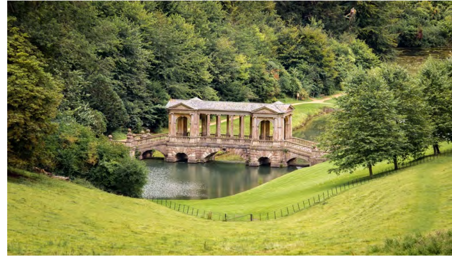
Plate 10. Prior Park on the edge of Bath