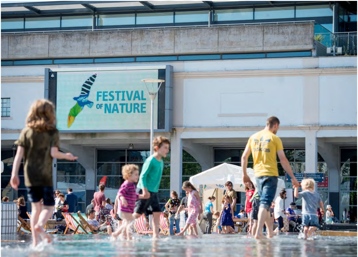
Plate 15. Bristol Festival of Nature